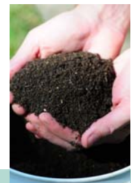
Removing finished compost!

Maintain compost at 50% water. If you can't squeeze two drops of water when clenching the compost in your fist, then add more water.