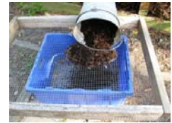
Screening compost from Phase 1 to Phase 2

If the above fails, please email us for advice at info@microbialearth.com